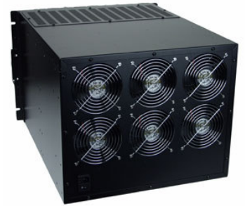
Six rear exhaust fans on the NMB100 ensure sufficient airflow.

The NMR100 is a 1U rackmountable server that can support any standard ATX motherboard. It is ideal for running applications such as firewalls. The NMR200 is a 2U version which can accommodate more storage. It is ideal for email or web servers.