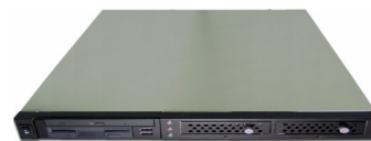
The NMR100 1U rackmount app server

The NMR100 1-U rackmount server is ideal for being used as a single-purpose network appliance. Applications include running email, web server, bandwidth management, network monitoring, Instant Messaging, firewall, and antivirus. Just give us your requirement and we will pre-install the application for you.