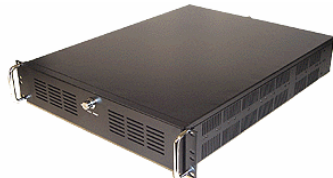
The NMR200 2U rackmount app server

NetMachines can be bought as pure hardware, or customers can avail of the NetCare package. With NetCare , Mozcom will pre-install and pre-configure either Microsoft Windows™ or Red Hat Linux server operating systems based on your requirements, and will provide one year of OS support. This ensures you will get the latest patches and avail of expert advise from our pool of Microsoft and Red Hat Certified professionals.