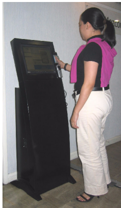
The NMK-100 kiosk used as a VoIP station and running Net-Secure Biometric TimeKeeper for time and attendance

Hardware Solutions http://www.mozcom.com/netmachine