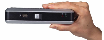
The NetMachine Mini NMM-100 weighs only 940 grams and is powered by an 800Mhz VIA EDEN processor. It comes with 2 x USB, 1 x serial, 1 x parallel and 1 x RJ45 port. The integrated graphics card supports up to 1280 x 1024.

Visit http://www.mozcom.com/netmachine or email sales@mozcom.com for more info.