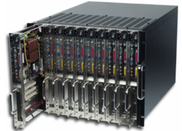
The NMB100 rackmount chassis can accommodate up to ten blades.

The NMB100 is a chassis + blade system. Each chassis can hold up to a maximum of 10 blades. This is ideal for implementing high-availability or load-balancing clusters at the least amount of space. It is ideal for running computation-intensive applications such as network gaming or graphics rendering farms. Dual processor blades are also available for the most demanding requirements.